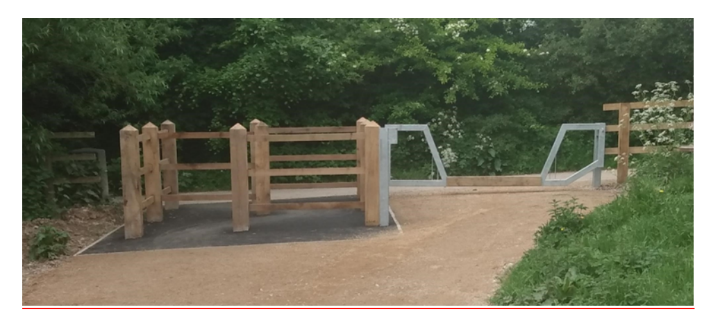
Oakwood Field Footpath Improvements